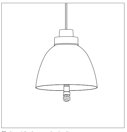
8° - Insert the lamp and enjoy it.